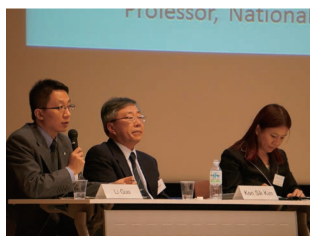
The 17th Symposium held on July 6, 2012