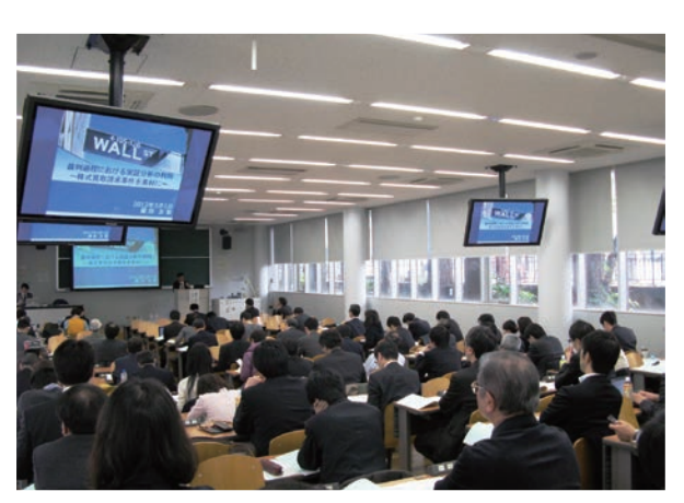
The 15th Symposium "Statistical and Econometric Methods and Legal System" (March 1, 2012)

The Soft Law Project not only expanded the realm of conventional legal interpretation studies, it also identified the problems found in the methods and agendas of those conventional studies, and it urged innovation. This project does not end with the accomplishments of a decade of study and activity; it continues to develop. We will proceed with this work even after the completion of the Global COE Program.