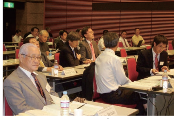
2nd Annual BESETO Conference "Changing Society and the Role of Law" (September 19, 2008)

The Soft Law Project as the activities of the Global GOE will end in 2013. However, because, in a sense, the study of soft laws has just begun and because soft laws themselves are constantly being made, developed. and changed, the end of the Soft Law Project itself does not mean the completion of the studies of soft laws. Our faculty has already obtained Grants-in-Aid for Scientific Research of Japan Society for the Promotion of Science and we have started the activities that will become the successor to part of the Soft Law Project. Furthermore, we are planning to enlarge these activities. With respect to human resource development, although the scale of our overseas dispatching program will be decreased, we intend to continue this program for the time being at least. I ask for your further cooperation and support of our Soft Law Project.