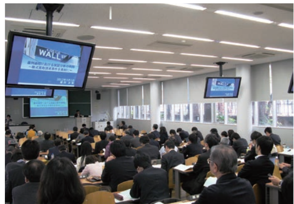
The 15th Symposium "Statistical and Econometric Methods and Legal System" (March 1, 2012)

The Soft Law Project not only expanded the realm of conventional legal interpretation studies, it also identified the problems found in the methods and agendas of those conventional studies, and it urged innovation. This project does not end with the accomplishments of a decade of study and activity; it continues to develop. We will proceed with this work even after the completion of the Global COE Program.