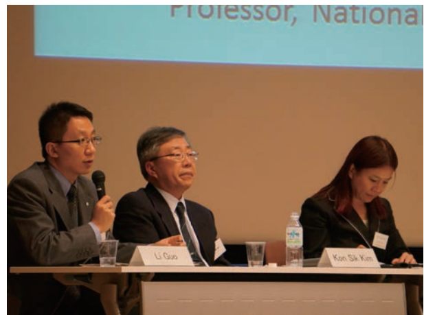
The 17th Symposium held on July 6, 2012