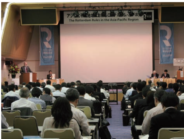
The 13th Symposium held on November 21, 2011