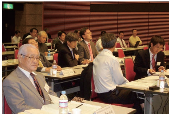
2nd Annual BESETO Conference "Changing Society and the Role of Law" (September 19, 2008)

The Soft Law Project as the activities of the Global GOE will end in 2013. However, because, in a sense, the study of soft laws has just begun and because soft laws themselves are constantly being made, developed, and changed, the end of the Soft Law Project itself does not mean the completion of the studies of soft laws. Our faculty has already obtained Grants-in-Aid for Scientific Research of Japan Society for the Promotion of Science and we have started the activities that will become the successor to part of the Soft Law Project. Furthermore, we are planning to enlarge these activities. With respect to human resource development, although the scale of our overseas dispatching program will be decreased, we intend to continue this program for the time being at least. I ask for your further cooperation and support of our Soft Law Project.